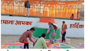
मनोहरथाना. गणतंत्र दिवस की तैयारी करते हुए।