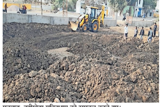
पनवाड़. दहीखेड़ा मुक्तिधाम को समतल करते हुए।